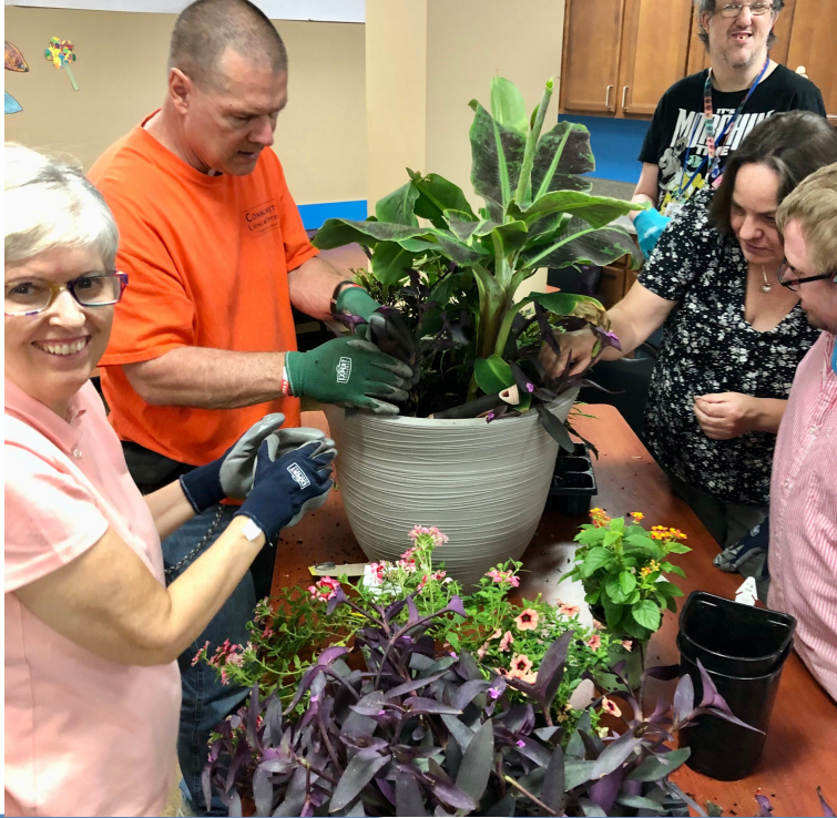
Participants and staff helped plant donated flowers from Wenke Greenhouses into new planters at the Alcott Center!