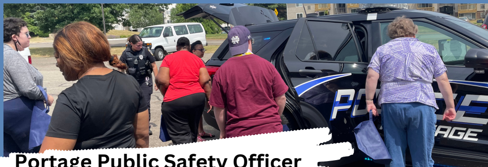
Portage Public Safety Officer came to visit Alcott, have some breakfast, and chat with the participants and staff